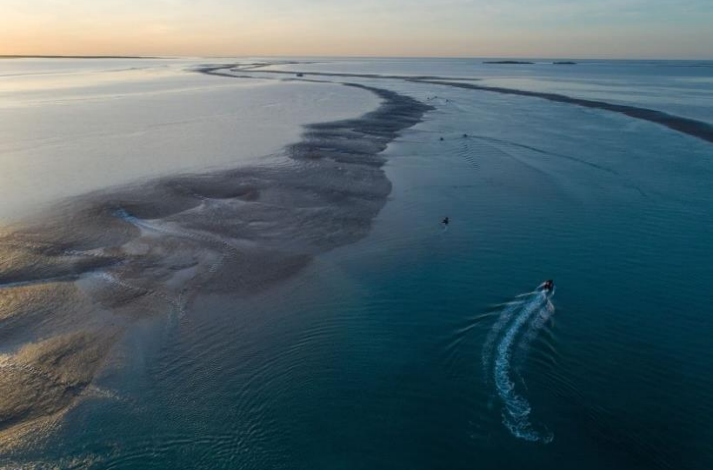
Suggested itinerary: please note itinerary is subject to change due to weather/sea conditions