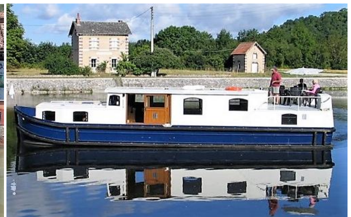
Classic 139 Grand Cru

CONTACT OUTDOOR TRAVEL FOR RESERVATIONS ON 1800 331 582