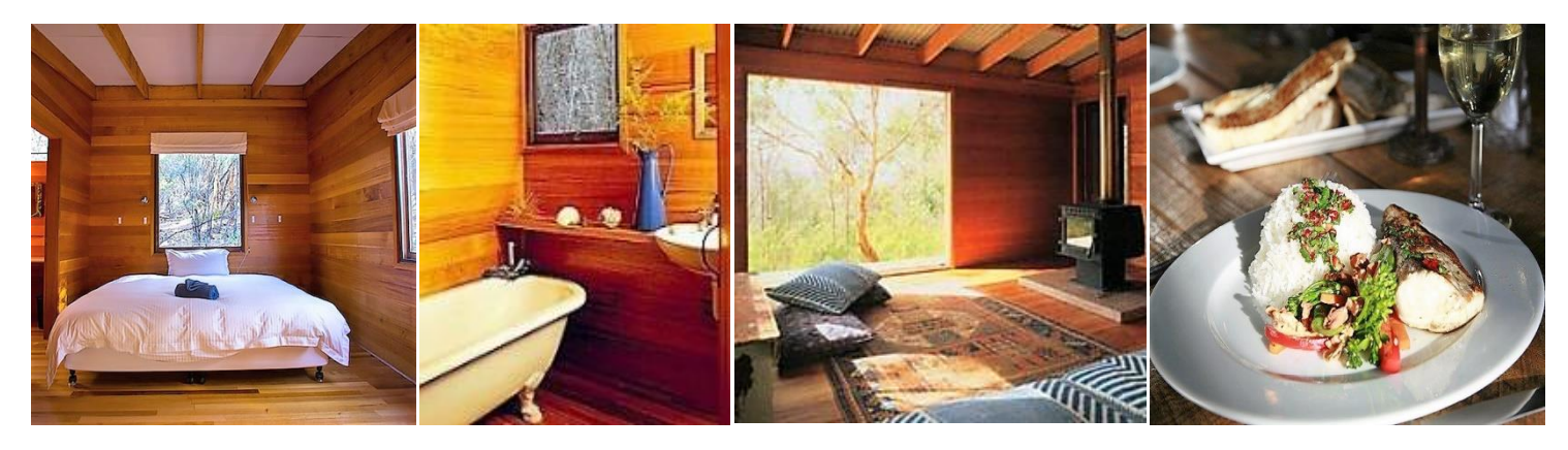
"The Freycinet Experience's combination of gorgeous landscapes and prevailing ethos of 'luxury without harm' is enough to leave visitors on a natural – and sustainable – high." Gourmet Traveller Magazine