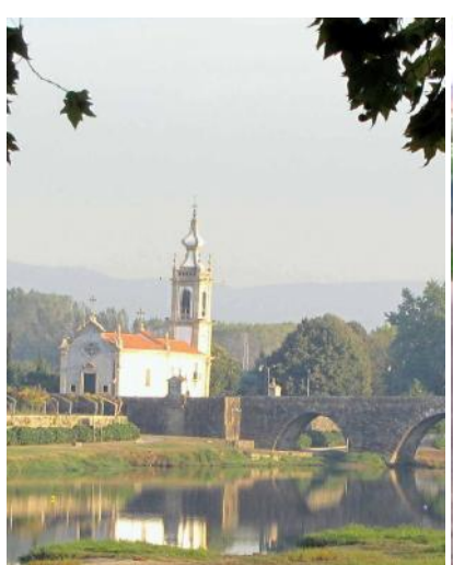
Day 7: Tui Walking tour arrangements end after breakfast.

A day that begins in Portugal and ends in Spain. Apart from a short climb to leave the Coura valley, most of the route is downhill on quiet country roads and forest pathways first to the walled town of Valença, and then over the river Minho / Miño, which forms the border between Portugal and Spain, to the historic town of Tui. Two bridges connect Tui and Valença and there are normally no formalities in crossing what is the busiest border-point in Northern Portugal. On arrival in Tui you may like to stroll through the picturesque streets of the town and take time to visit the 12<sup>th</sup> Century cathedral.