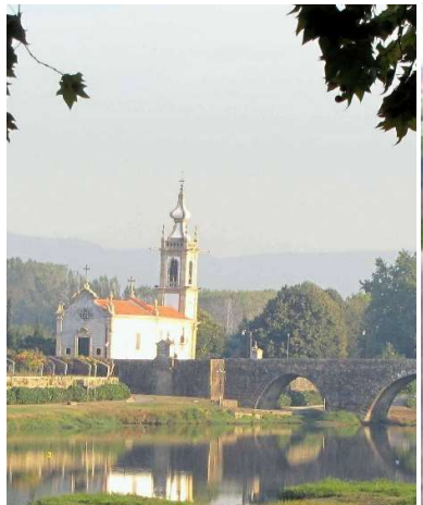
Day 7: Tui Walking tour arrangements end after breakfast.

A day that begins in Portugal and ends in Spain. Apart from a short climb to leave the Coura valley, most of the route is downhill on quiet country roads and forest pathways first to the walled town of Valença, and then over the river Minho / Miño, which forms the border between Portugal and Spain, to the historic town of Tui. Two bridges connect Tui and Valença and there are normally no formalities in crossing what is the busiest border-point in Northern Portugal. On arrival in Tui you may like to stroll through the picturesque streets of the town and take time to visit the 12<sup>th</sup> Century cathedral.