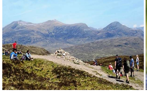
Day 10: Departure day Tour ends after breakfast at Alltshellach Country House near to Glen Coe.

A steep but short climb out of Kinlochleven takes us on to Lairigmor. With magnificent mountains either side our walk makes a final ascent through forestry, to the hillside above Glen Nevis, for spectacular views of Ben Nevis, Britain's highest mountain. Continuing down the glen, we end our walk in Fort William.