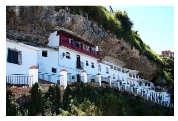
Day 8 Tour ends Your walking tour ends after breakfast in Ronda.

A route following an ancient, cobbled path and then through fields and small family farms to reach the city of Ronda, where a spectacular bridge spans the deep river gorge, which literally divides the city into two. Accommodation is overnight in Ronda. The historical Moorish quarter is well worth a visit.