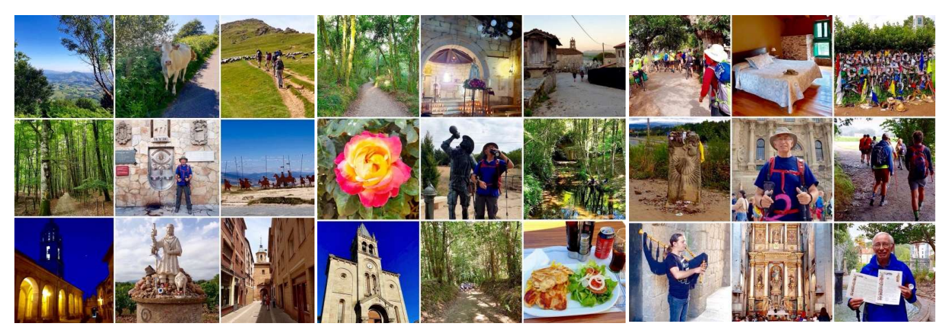
LOGROÑO – BURGOS – 7-days / 6-nights (5-days of walking in Spain)

Solo Traveller supplement: From $60 per person (as available)